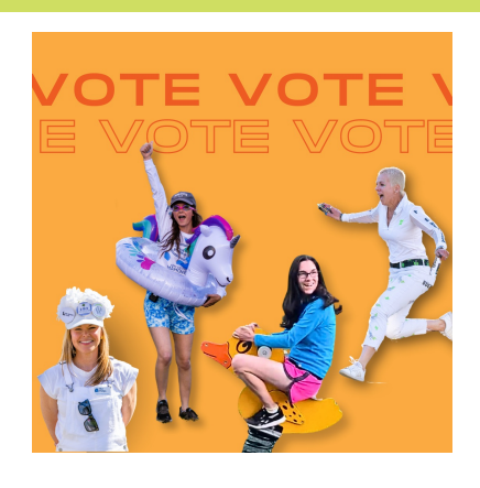
Sponsor a Jockey