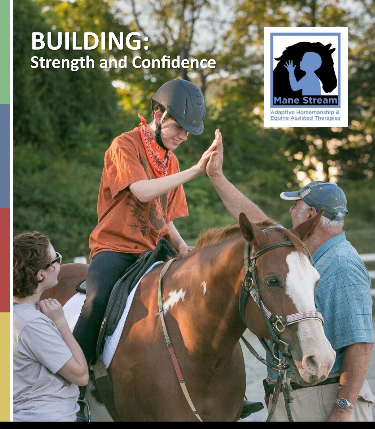
2015 ANNUAL REPORT